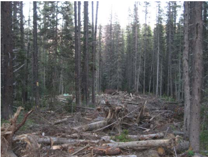
This spur leads to one of seventy drill pads at the Kwanika exploration site. Exploration requires clearing swaths of forest and disturbs the wildlife in the area. Reclamation will consist of covering the cut logs with grass seed.