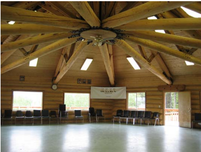
Takla's potlatch house is the center of the community's traditional governance system. It is used for meetings of keyoh holders and other local gatherings.