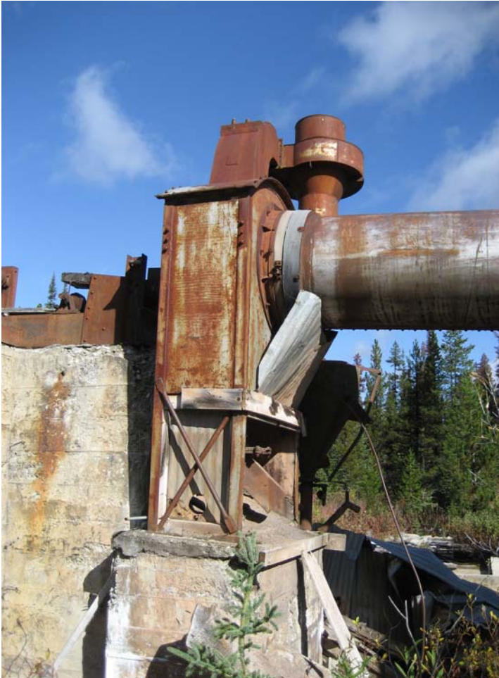
The abandoned Bralorne-Takla Mine, which dates to World War II, still has rusted equipment that was used in mercury mining operations.