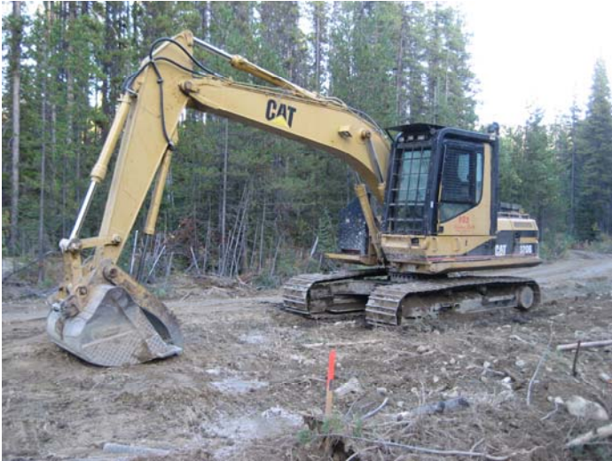
A backhoe used at the Kwanika exploration site stands on a road that has been cut through the forest to allow drilling equipment to pass.